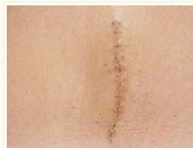
The spine is a tricky place to operate, and surgery is not always successful.

Patients must carefully consider the decision to undergo back surgery . The spine is a difficult and delicate place to operate and surgeons are only sometimes able to lessen pain and improve movement, which is why doctors strongly recommend patients seek a second opinion before making a choice. Two patients share their stories about their decision to go under the knife.